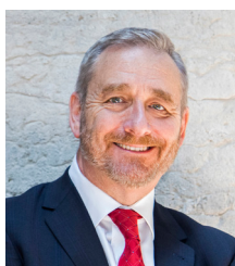
DAVE YOST Auditor of State