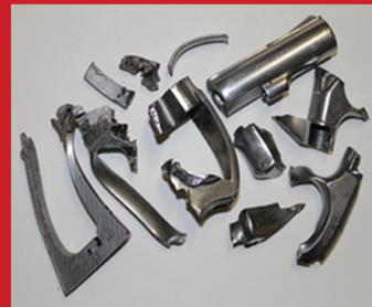
ATF Compliant Destruction Process