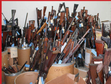
Eliminate Overcrowded Property Rooms